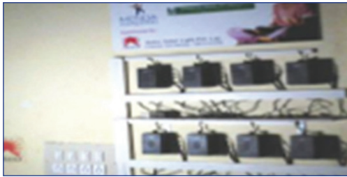
Solar Lamps Charging Station

Most of the population in rural India has a very unreliable access to the grid because of which the most valuable time for study during night is lost. The students mostly use kerosene lamps or candles for studying at night. The smoke and heat irritates eyes and nose and affects the concentration. There is also the risk of fire accidents when children use kerosene lamps. LFE program aims to overcome the above issues and develop a holistic approach for the students and avail them effective solar lighting system to empower their dreams to study. In association with the Menda Foundation, your company sponsored solar powered LED Lamps to the students. The program also helps to create awareness in the young minds about renewable energy and sustainable energy usage.