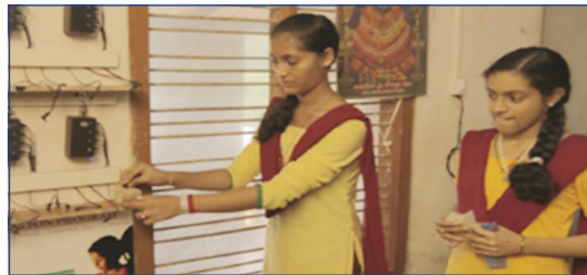
Students charging the battery from the charging station fixed in the school