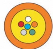
Indoor Tight Buffered Cable