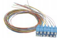
SC Simplex Singlemode Pigtails