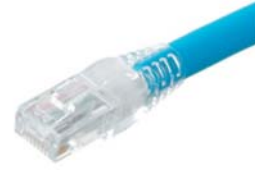
C6A UTP Patchcord