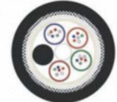
Outdoor Armoured Gel-Filled loose Tube Cable